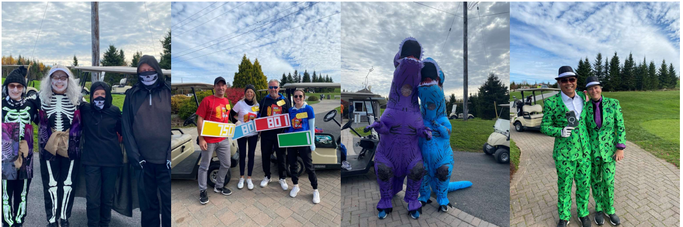
Olands Brewery function to commemorate the passing of an old friend