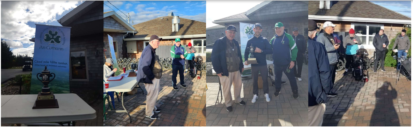
The annual Dexter's Revenge - Apologies to the other golfers for the pin placements :)